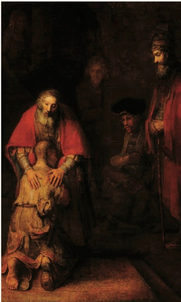
Image: Rembrandt cc

"O my God, teach me to be generous: to serve you as you deserve to be served, to give without counting the cost, to fight without fear of being wounded and to work without seeking rest."